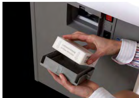
The CleanTEC® filter traps up to 98% of the fine dust, and provides a cleaner, healthier work environment.