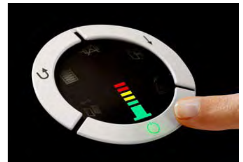
The easy-to-use command dial controls all of the shredder's functions and illuminates the proximity to sheet capacity.